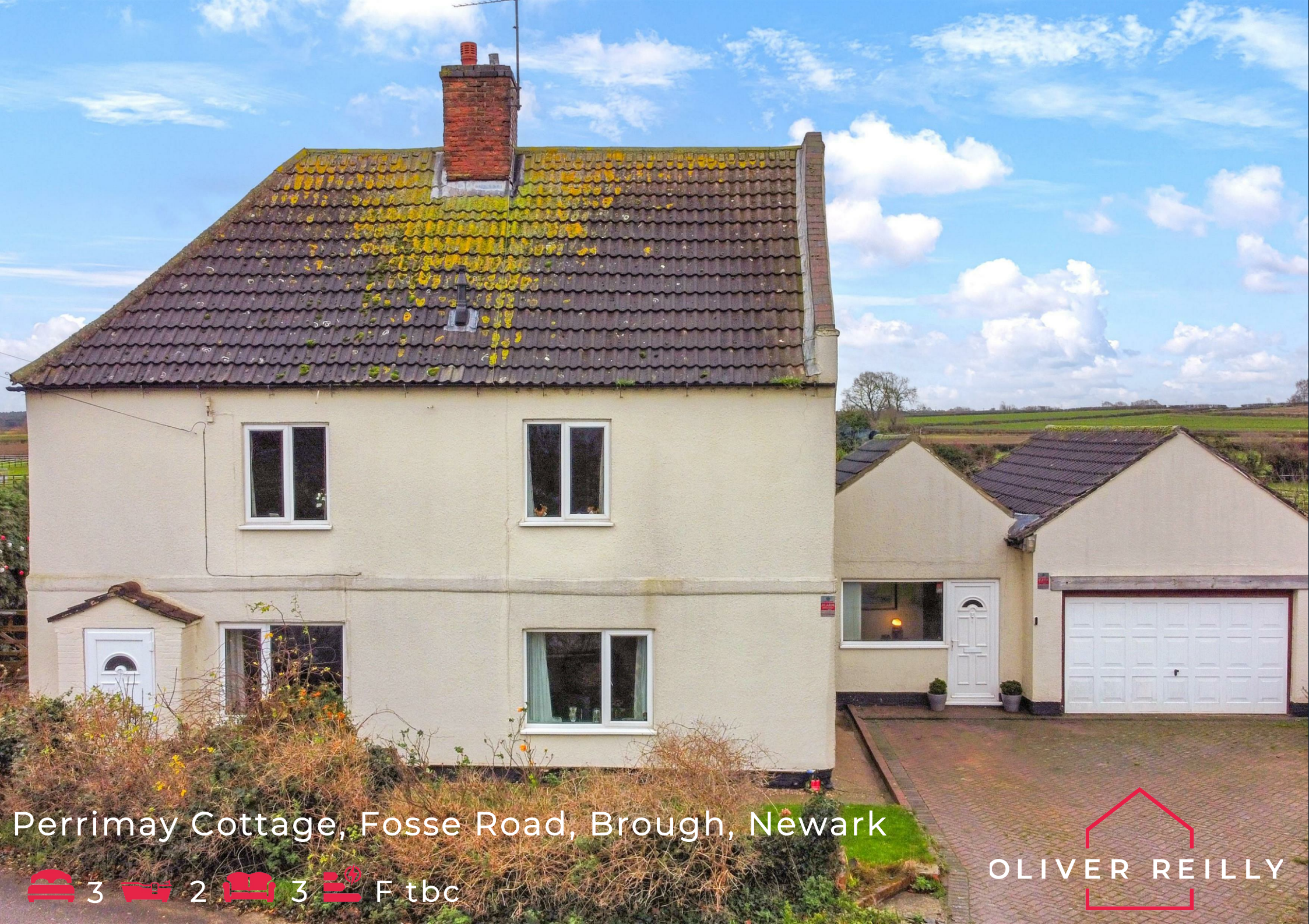
Perrimay Cottage, Fosse Road, Brough, Newark